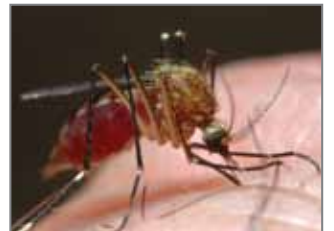
Pest Management Images