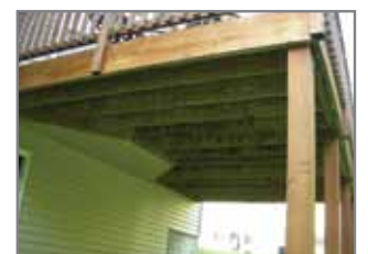
Adult mosquitoes rest in protected places, usually dark, damp areas with little air movement.