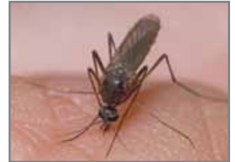
Pest Management Images

Mosquitoes have been implicated in vectoring many diseases to humans. Malaria, encephalitis and West Nile virus are among the more serious. Yellow Fever and Dengue Fever are two other very serious problems worldwide. Aside from the serious health risks, mosquitoes' presence is annoying to humans who spend time outdoors, their bites produce itchy welts and the enjoyment of many outdoor areas is curtailed.