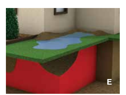
Illustrations are not to scale.