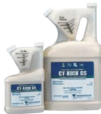
Cy-Kick CS controls a broad array of insects and has a long-lasting residual

"The microencapsulation method makes the product last longer. It's that simple," says Schendel President and General Manager,